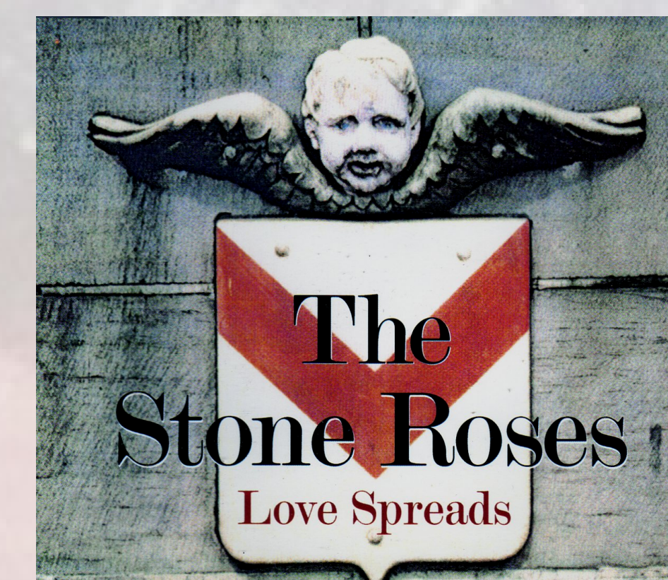
Cover of the Love Spreads single